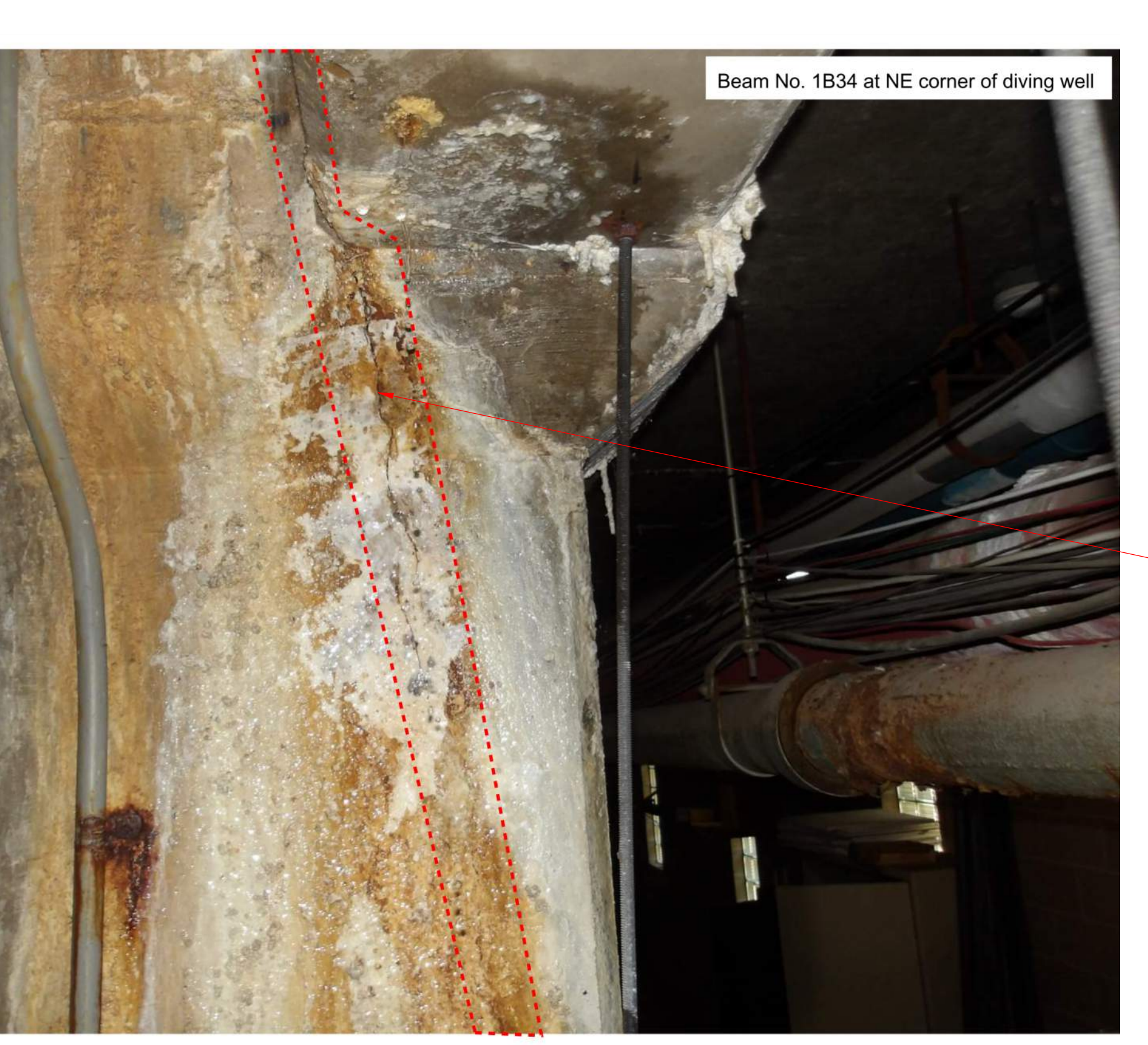
<u>PHOTO 3 - BEAM 1B34</u>